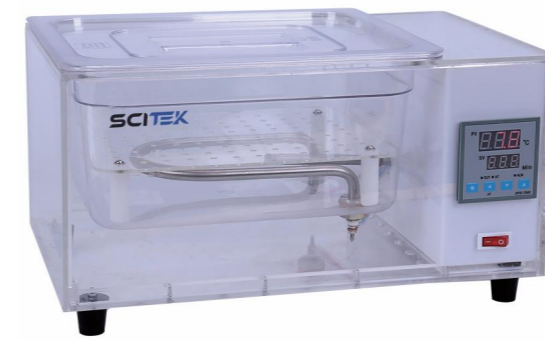
TWB-7 TWB-9 TWB-26