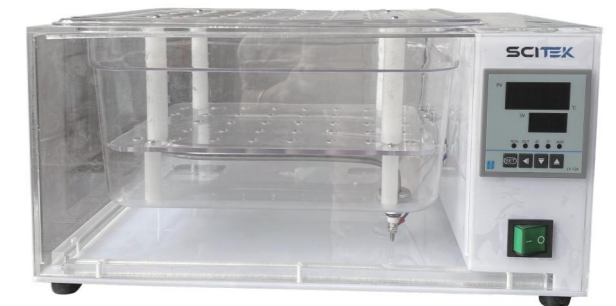
TWB-6 TWB-10 TWB-20