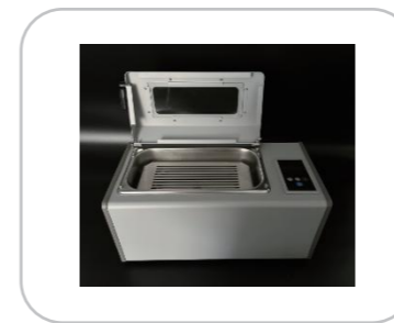
Lab Water Tank