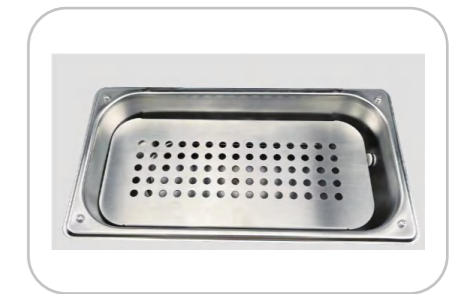
Stainless steel chamber Corrosion-resistant, easy to clean, equipped with thickened bearing frame