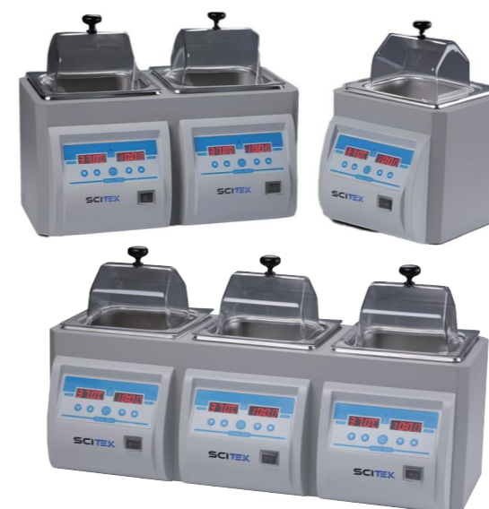
WB-1L1HII / WB-1L2HII / WB-1L3H